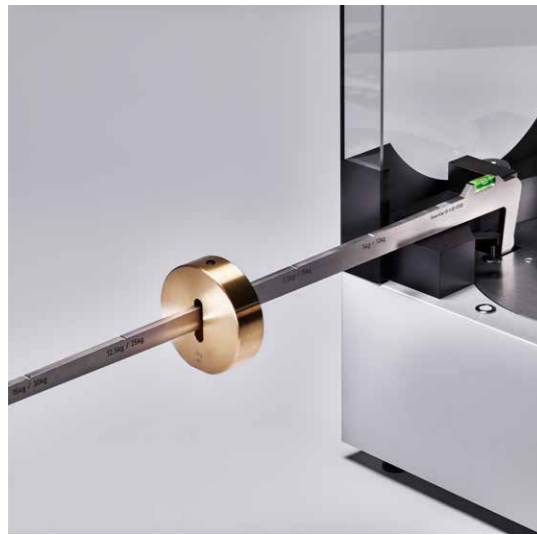
Static qualification with a single SmartCal™ reference weight that can be applied in multiple positions