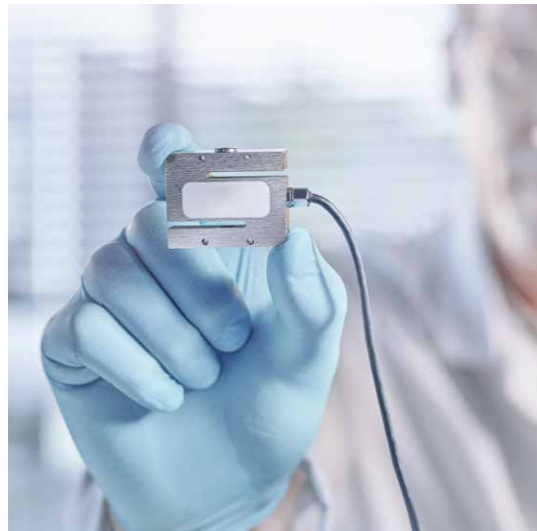
Dynamic qualification of the entire hardness range without requiring static reference weights

The patented SmartCal™ system uses a single certified reference weight in multiple positions to change the force applied on the ST50 load cell. A menu-guided qualification routine allows for high-precision adjustment and verification with different loads applied. Calibration does not require any (partial) disassembly of the tester or stacking of several reference weights.