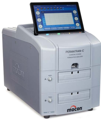
Interchangeable cartridge options such as package adapter and reduced area cartridges expand testing capabilities